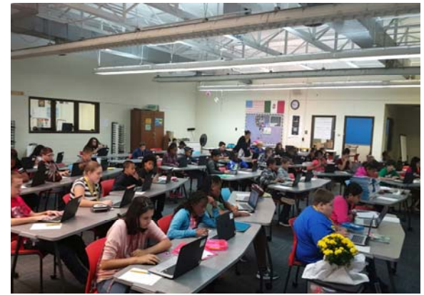
Students work hard to learn how to use our online assessment programs.

We are continuing to work on our Orientation project which highlights the main components of our culture at New Tech: Trust, Respect and Responsibility. (All teachers)